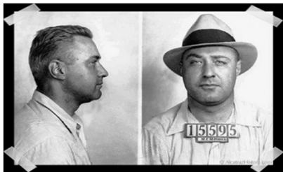
George “Machine Gun” Kelly U.S.P. Alcatraz – “Public Enemy #1”