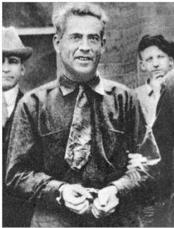
Roy Gardner U.S.P. Alcatraz “King Of The Escape Artists” & “Last Great American Train Robber”